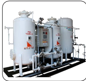
MEDICAL O2 PLANT