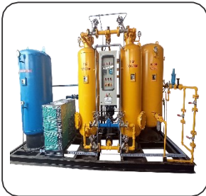
PSA N2 PLANT